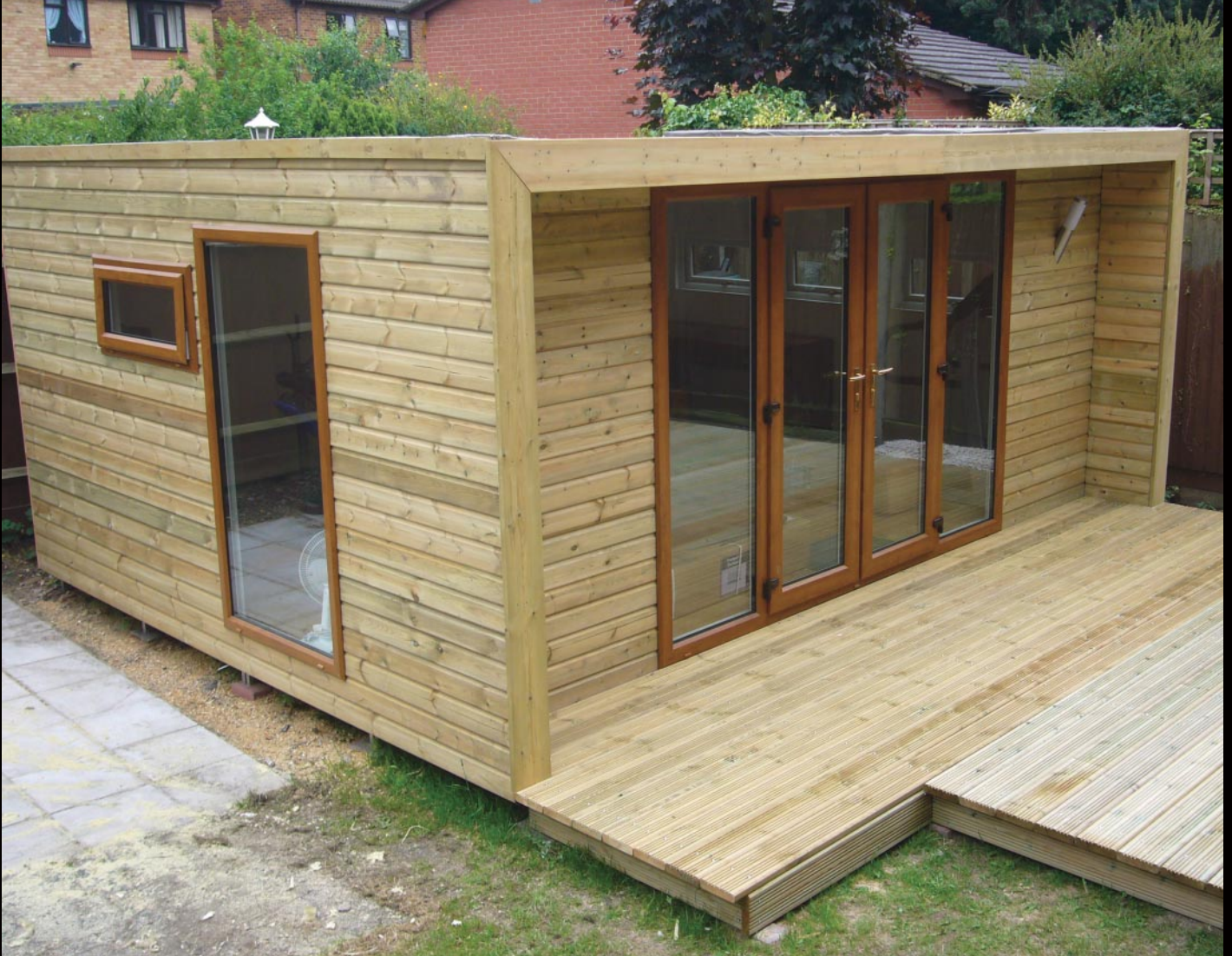
The Buckingham with Picture Window, Electric Upgrade, Decking to Customer Specification