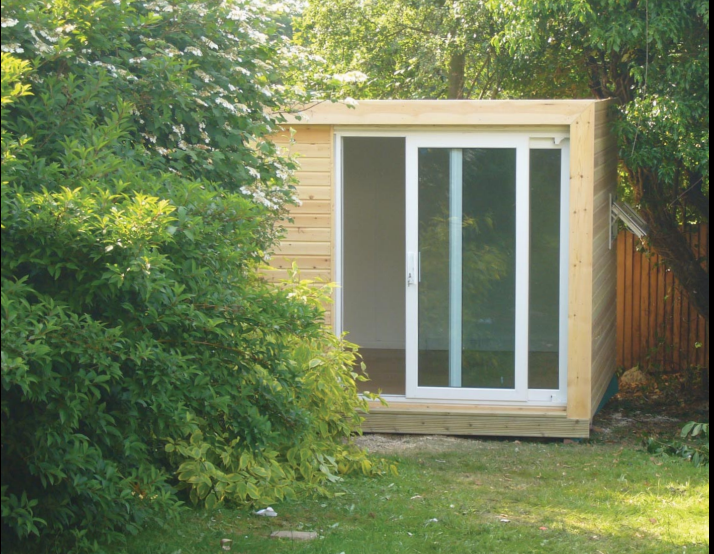
The Eden with Combination Window, Picture Window, Deck Lights and Deck Extension Option